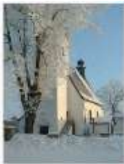
Small White Church