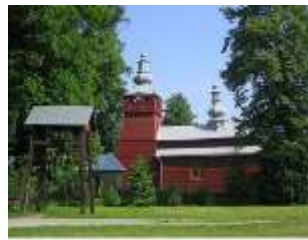
Greek Catholic church