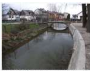
Dursztyński Potok running through Krempachy village